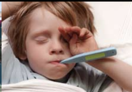
The 24-hour pharmacy?