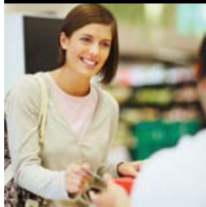
The grocery store?