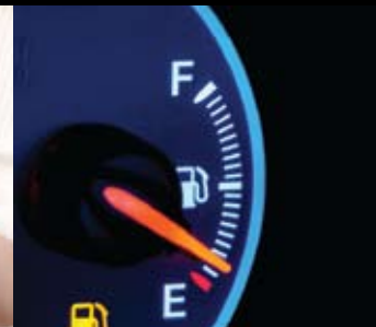
The gas station?