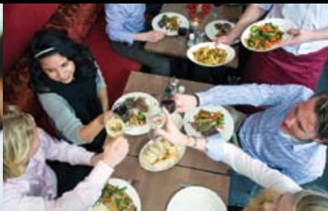
Out to dinner with friends?